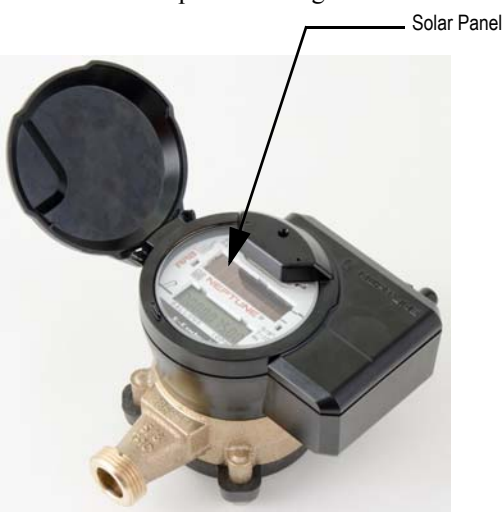
Figure 4 Solar Panel for E-Coder)R450i

The solar panel is located in the center of the faceplate of the E-Coder)R450 i , and it supplies the power for the LCD panel. It is light-activated. See Figure 4.