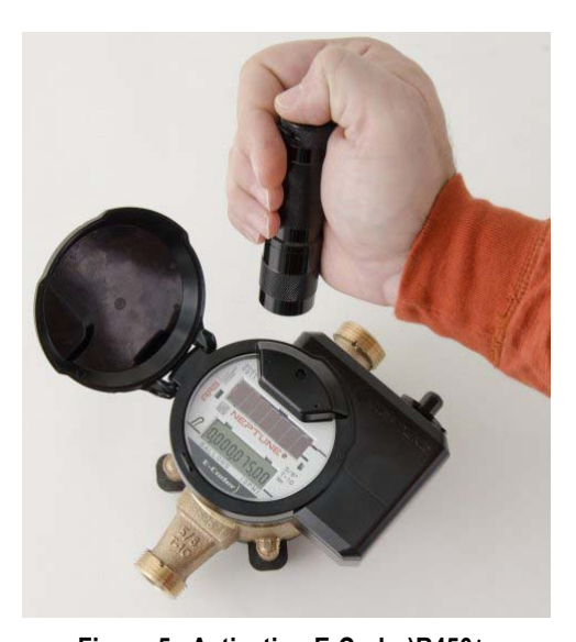
Figure 5 Activating E-Coder)R450 i

The solar panel activates the LCD display when the unit is exposed to a light source. For example, a unit mounted in an inside location would turn on the LCD when the room light is turned on. A unit mounted in an outside pit would turn on the LCD when the pit lid is opened exposing the unit to daylight. If the LCD is currently off, the LCD may be reactivated by covering the dial plate with your hand for about two seconds. In bright sunlight, it may be necessary to close the cover or the pit lid momentarily. If the LCD does not reactivate as expected, try shining a flashlight on the solar panel.